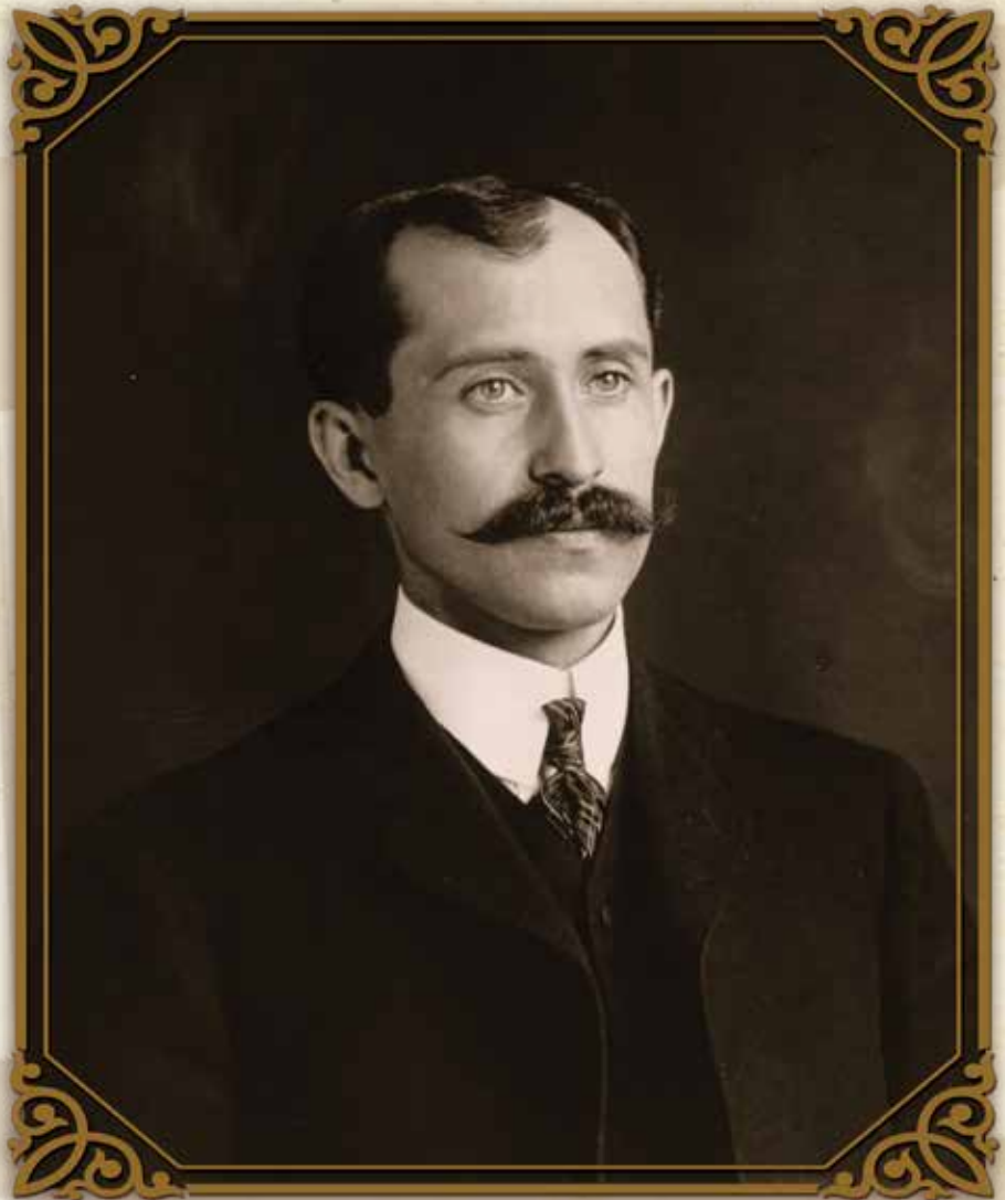
Orville Wright, Age 34

Lucrative prizes, of course, precede human flight. As early as 1567, European sovereigns offered prizes for a solution to the vexing problem of accurately determining a ship's longitude at sea, culminating in the eponymous 1714 Longitude Prize. 7 Unlike government contracts and grants—i.e., the conventional, heavily regulated, cumbersome, scandal-laden, and oft-criticized