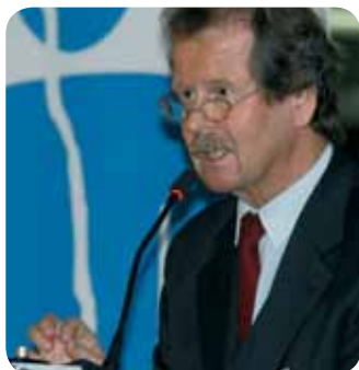
UNITED NATIONS SPECIAL RAPPORTEUR ON TORTURE (2004–2010), PROFESSOR MANFRED NOWAK IN HIS ANNUAL REPORT TO THE UNITED NATIONS GENERAL ASSEMBLY, SEPTEMBER 2010.

At the government level, the IRCT lobbies states to ratify and abide by those international instruments related to torture, and increase support for rehabilitation services (either directly or via the United Nations Voluntary Fund for Victims of Torture. We also work to lobby the European Union to increase their support to torture survivors.) Where possible, we reinforce our messages by partnering with those who share our goals. Our participation and membership in groups such as the Coalition of International