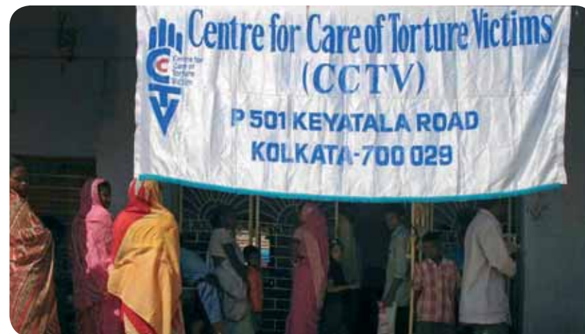
IN INDIA THE IRCT SUPPORTED MEMBER CENTRES, LED BY CCTV, IN LOBBYING FOR AN IMPROVED VERSION OF THE PROPOSED PREVENTION OF TORTURE BILL 2010 WHICH HAS BEEN PRESENTED AS ENABLING LEGISLATION FOR INDIAL RATIFICATION OF THE UN CONVENTION AGAINST TORTURE (SIGNED BY INDIA 1997). COMMENTS AND RECOMMENDATIONS TO THE DRAFT BILL, JUDGED AS INADEQUATE, WERE SUBMITTED BY CCTV IN SEPTEMBER 2010.

The IRCT has supported member centres around the world in their national campaigns. In 2010 we worked with members on campaigns in the United Kingdom, India, Lebanon and Ecuador, among others.