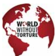
CAMPAIGN LOGO FOR WORLD WITHOUT TORTURE.

By the end of the year, around 5,000 people around the world were engaged in the movement, with information cascading to tens of thousands more via the social media platforms.