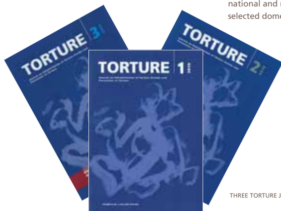
THREE TORTURE JOURNAL ISSUES WERE PUBLISHED IN 2010.

The third issue was comprised of a Desk study on Combating Torture with Medical Evidence – The use of medical evidence and expert opinions in international and regional judicial mechanisms and in selected domestic jurisdictions.