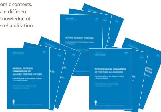
PRACTICAL GUIDES TO THE ISTANBUL PROTOCOL.

The IRCT published three practical guides to the Istanbul Protocol – the standard for the forensic documentation of torture – crucial in fighting impunity and providing redress for victims – for medical doctors, psychologists and lawyers. The guides were published in three different languages: English, French and Spanish – all available to download for free from the IRCT website.