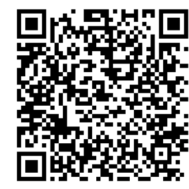
For More Information Visit Our Website:

All former participants are invited to join the Participant Association. By doing so, they can connect with the distinct network of Competition alumni from around the world, learn how to coordinate relevant events at their respective universities, and share ideas on how to improve the Competition with the moot court coordinators. For more information, please visit the Competition website.