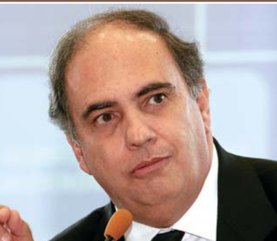
ANTÔNIO CANÇADO TRINDADE