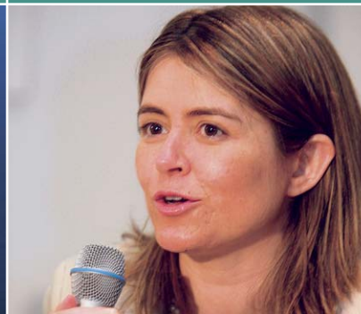
CATARINA DE ALBUQUERQUE