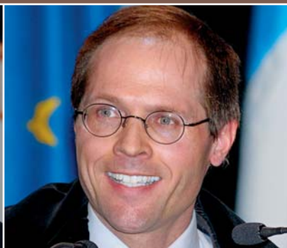
OLIVIER DE SCHUTTER