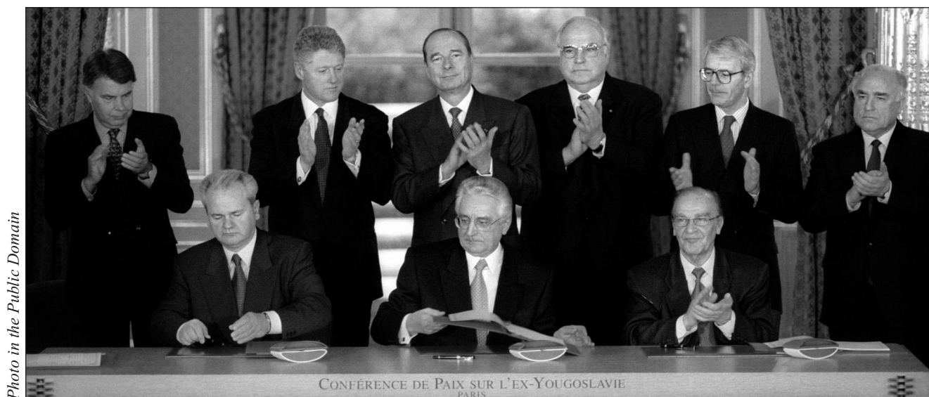
December 14, 1996 signing of the Dayton Peace Agreement in Paris, ending the war in the former Yugoslavia.

Fifteen years ago, the UN Security Council responded to devastating violence in the Balkans by taking novel action: it created a war crimes court as an enforcement measure under Chapter VII of the UN Charter. 2 At the time, many saw the Council's action as a cynical gesture, aimed at placating public demand for more assertive action to halt the carnage then in full rage in Bosnia-Herzegovina. Few, if any, believed that the Council's ad hoc innovation would become precedent for future action.