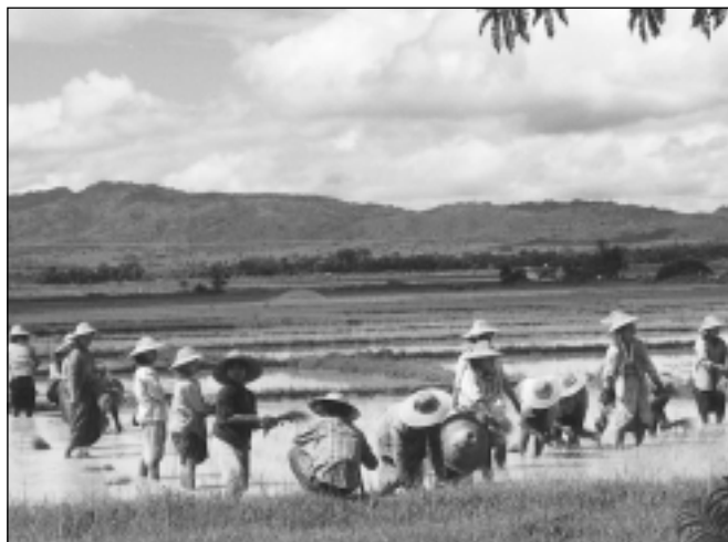
Burmese working in a rice field near Inle Lake.

Burma's current crisis involves profound and systematic dysfunction as a result of decades of governmental mismanagement. In this sense, Burma's crisis is a political prob-