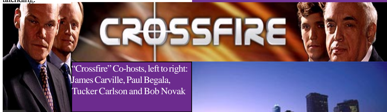
"Crossfire" Co-hosts, left to right: James Carville, Paul Begala, Tucker Carlson and Bob Novak