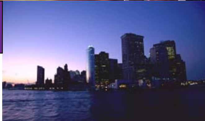
The Manhattan Skyline at dusk

If you are interested in helping plan the weekend's activities, contact Bree Myers at bhmyers@wcl.american.edu .